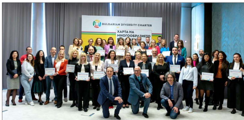
Bulgarian Diversity Charter Annual Meeting, Sofia, 12 May 2023

In 2023, CSD explored new dimensions of DE&I management focusing on inclusive communication in corporate environments . CSD got involved in the regional partnership NICE bringing together organisations behind the Diversity Charters in Bulgaria, Greece, Cyprus, Romania and Lithuania. The initiative