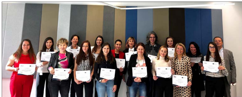
National communication panel “Neutral and Inclusive Communication in the Workplace”, Sofia, 7 November 2023

panies and NGOs in a constructive dialogue during two national events concerning the existing challenges faced by employees from underrepresented groups, and the way forward to developing tools for a more inclusive work environment. The public-private dialogue continued at the international level during a transnational panel held online in December 2023.