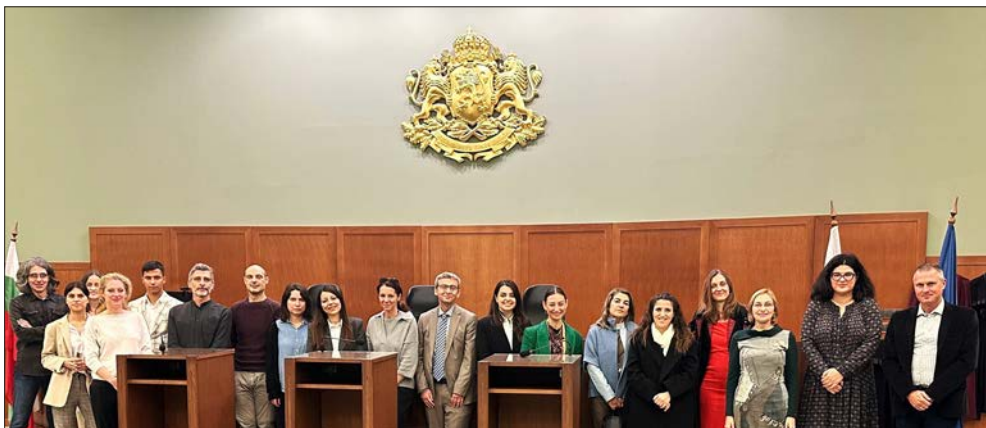
Greek and Cypriot judicial trainers during the study visit to the Sofia Regional Court, 27 October 2023

Capacity building is also among the key activities of CSD's initiative SHE, which aims to prevent domestic and gender-based violence through targeted training and awareness raising. In the context of heightened public sensitivity on the issue due to several serious cases of domestic violence becoming public, CSD continued its comprehensive training campaign in the public administration. Started as a specialised training for HR specialists, the campaign expanded its outreach to include public officials in