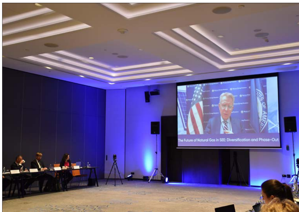
U.S. Assistant Secretary of State for Energy Resources Geoffrey Pyatt addressing the audience at the policy roundtable "The Future of Natural Gas in Southeast Europe", Sofia, March 2023

Broadening the social and policy impact of CSD work through strategic online communication has been among the priorities for CSD's communications team. Continuous work in building up CSD's social media portfolio across various platforms and networks expanded the deployment and visibility of research and key policy recommendations. Developing new creative formats and strategically promoting them across channels has resulted in 76% increase in CSD's digital audience.